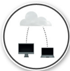
YOUR PERSONAL CLOUD

We've packaged AppEazy into six different systems that should fit nearly any small or mid-sized business. Let us know what we can do to find a system that fits your businesses needs. Shoot us an email at sales@applianz.com if you have any questions.